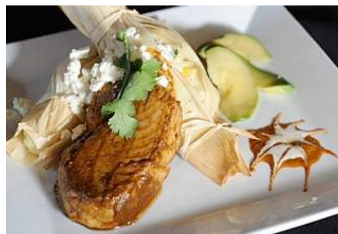
Purchase this Photo

The Fish House, 600 S. Barracks St., Pensacola. 470-0003, or visit www.goodgrits.com .